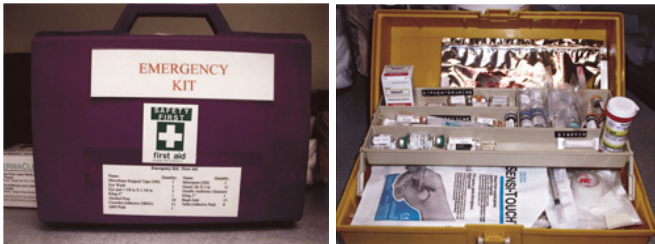
FIGURE 2-2. An office crash cart should be readily accessible, with clearly labeled and updated contents.